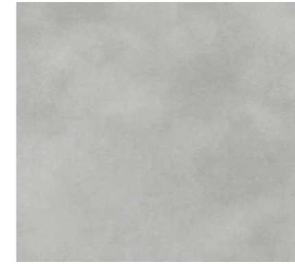
Alloyed Cement Tile 3133