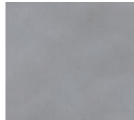
Suburban Cement Tile 3134