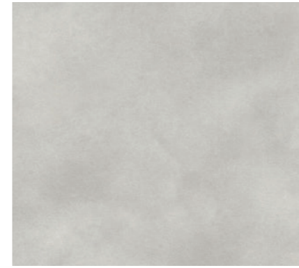
Polished Cement Tile 3132