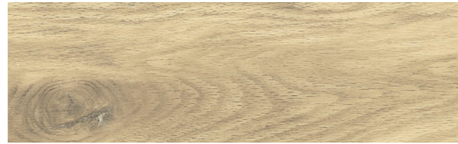
Barleycorn Oak 3128