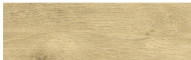
Hemingway Oak 3126