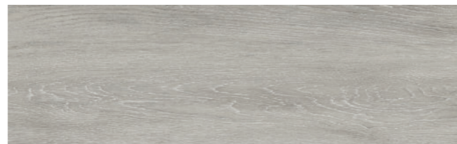
Wharf Side Ash 3124