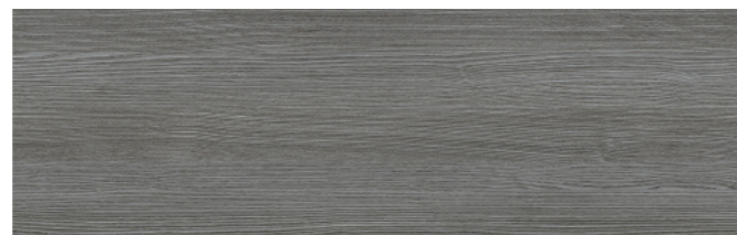
Dark Linear Wood 3123