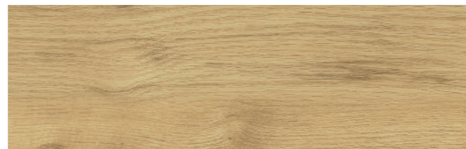
Devonshire Oak 3129