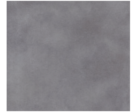
Downtown Cement Tile 3135