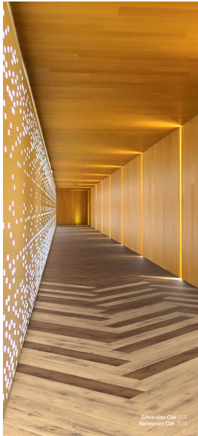
Edwardian Oak 3131 Barleycorn Oak 3128