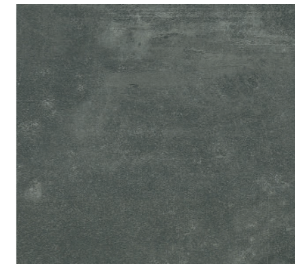
Cliffside Slate Plank 3136